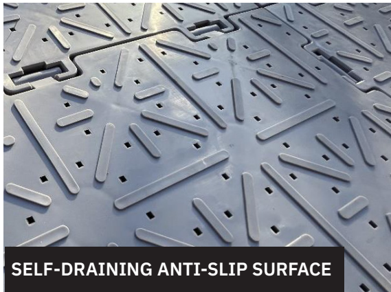
SELF-DRAINING ANTI-SLIP SURFACE

Stadia X Eco is a lightweight, pedestrian-focused flooring system designed for a variety of outdoor applications.